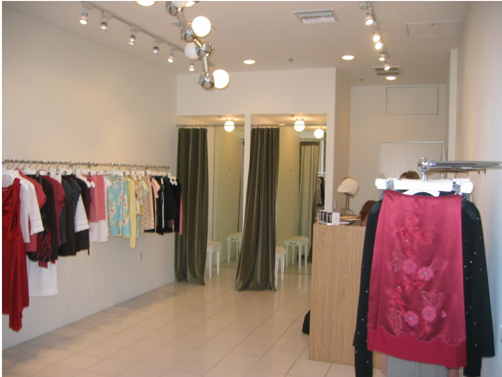
White Ceramic Tile and Halogen Track Lighting Give the Interior a Clean Contemporary Look