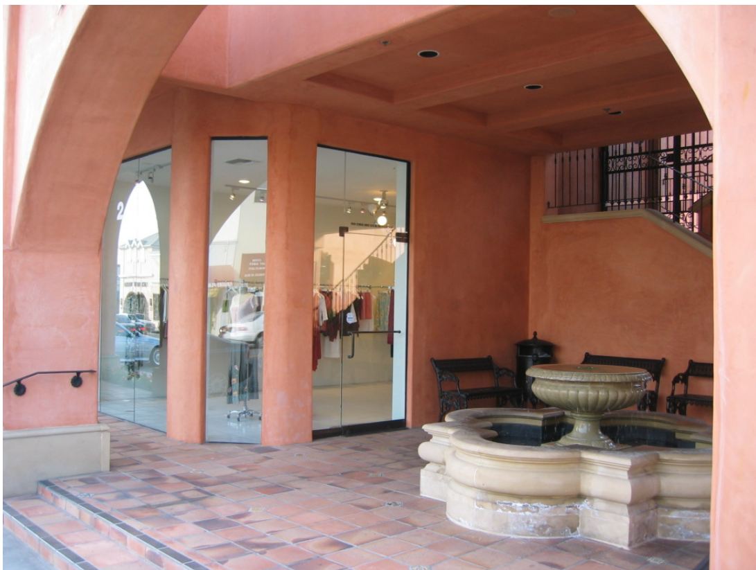
Beautiful Fountain and Floor to Ceiling Glass Highlight Entryway