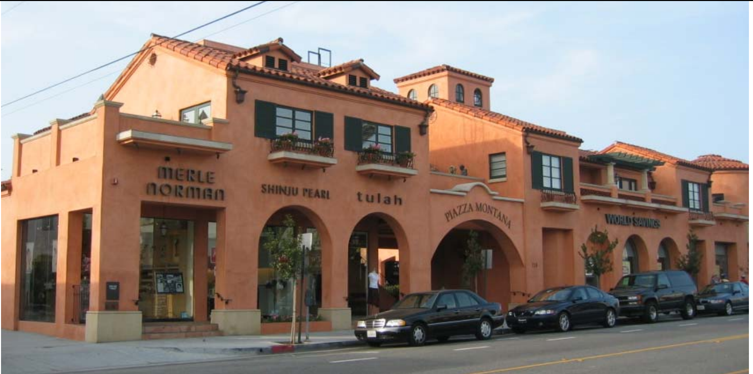
Attractive Mediterranean Architecture of Piazza Montana