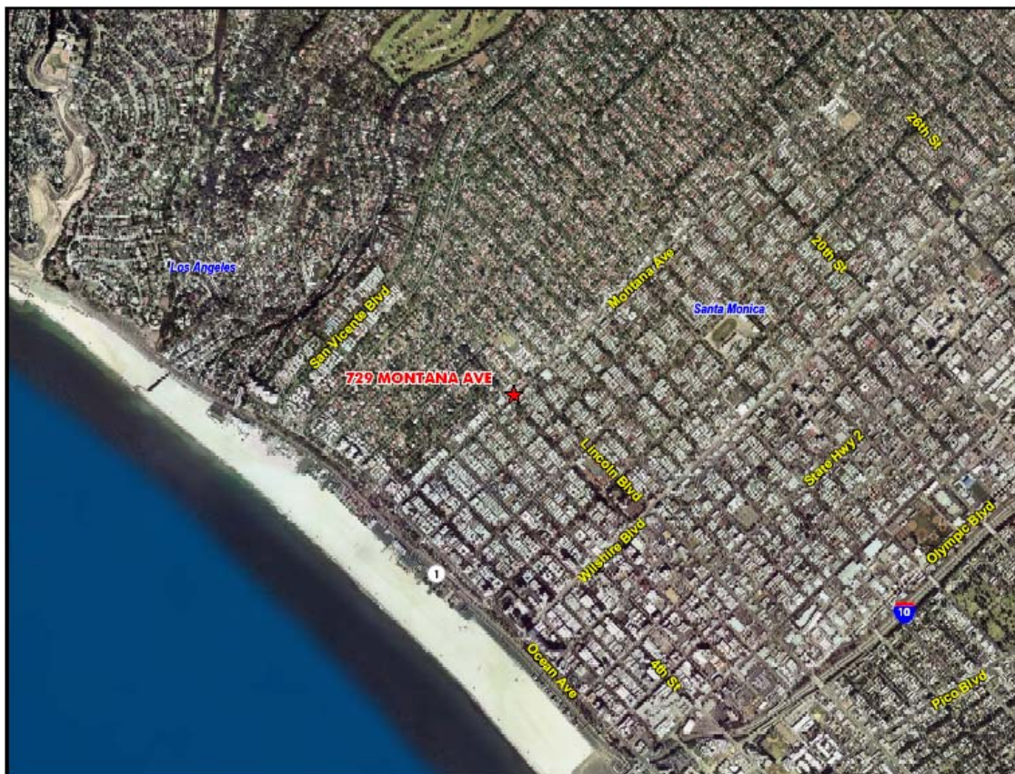
3 Mile Radius Aerial Map