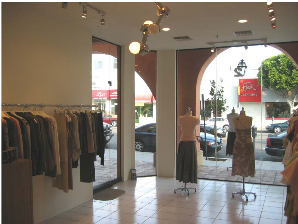
An Abundance of Glass Windows and Exterior Arches Draw In Customers